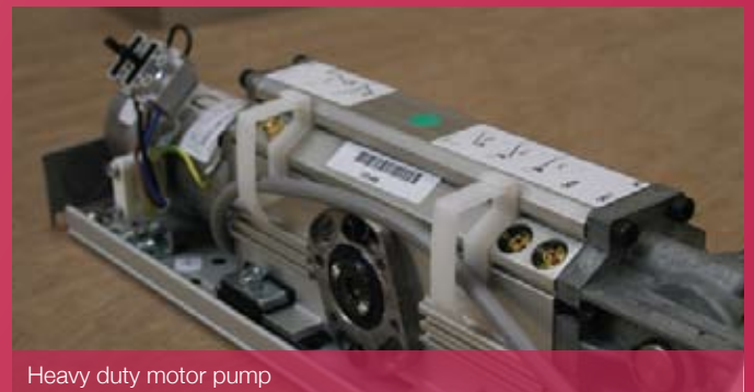
Heavy duty motor pump

The EMSW offers an excellent fire rating and is approved for fire door installations by the German and Swedish authorities.