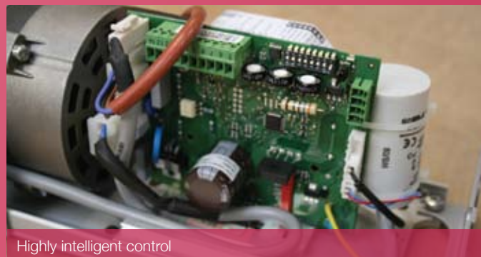
Highly intelligent control